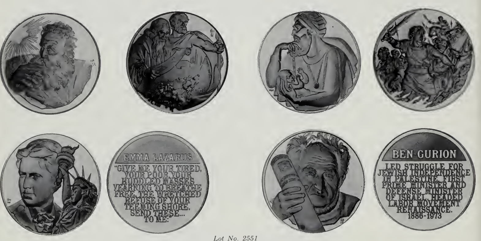
Lot No. 2551 (Representative examples illustrated)